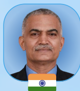
Admiral R. Hari Kumar

Secretary (East), Ministry of External Affairs India