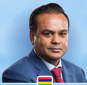
Dhananjay Ramful Minister of Foreign Affairs, Regional Integration and International Trade Mauritius