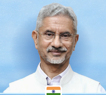
S. Jaishankar External Affairs Minister India