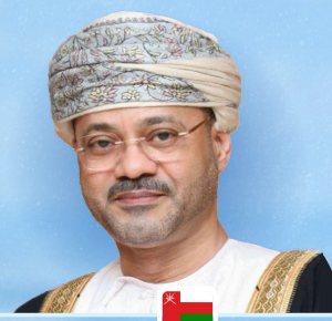
Sayyid Badr bin Hamad Al Busaidi Foreign Minister Oman