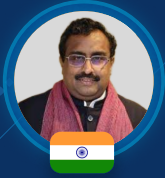
Ram Madhav Member, Governing Council, India Foundation, India