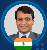
Suresh Prabhu Former Union Minister, Government of India