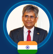
Saurabh Kumar Secretary (East), Ministry of External Affairs, Government of India