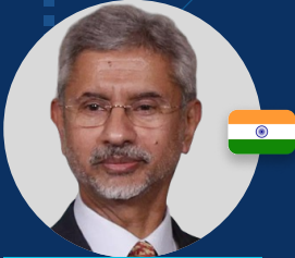
Dr S Jaishankar External Affairs Minister India