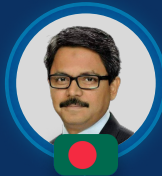
Md Shahriar Alam Minister of State for Foreign Affairs, Government of Bangladesh