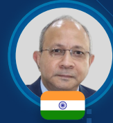
Pankaj Saran Former Deputy NSA, Government of India