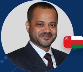
Sayyid Badr bin Hamad bin Hamood Albusaidi Foreign Minister Sultanate of Oman