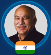
M J Akbar Former Minister, Government of India