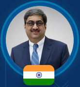
Gautam Bambawale Former Ambassador, India