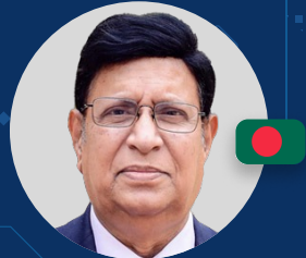
Dr A K Abdul Momen Minister for Foreign Affairs People's Republic of Bangladesh